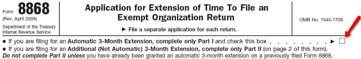
Figure 1., page 1

The top of the first page indicates that this is Form 8868 and that it is for exempt organizations to use to apply for an extension of time to file an exempt organization return.