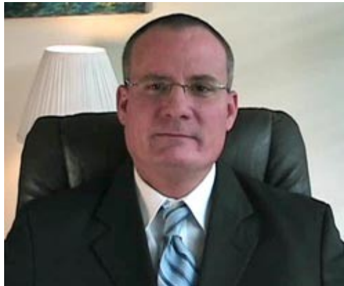
Who is David McRee, CPA?

See the completed example Forms 8868 at the end of this document, for both a first extension and a second extension, and for a typical Form 990-T extension request.